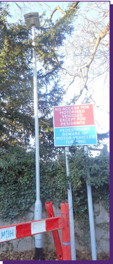
Erecting our new light.

With the safety of the public in mind and especially our children who attend Kirk Ella school, this new street lamp has been installed in the snicket that runs between West Ella Road and South Ella Way. The adjustment of the hour for winter time should not be a problem now.