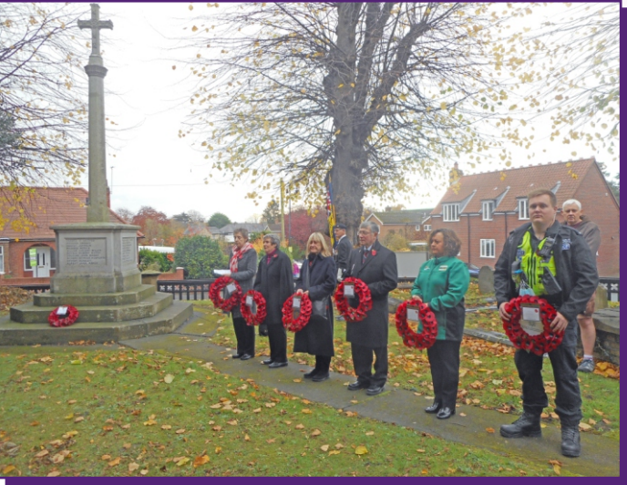
Representatives of the local community including the Church, the Police, the Mothers Union, British Legion and the Parish Council wait to lay their wreaths on the monument steps.