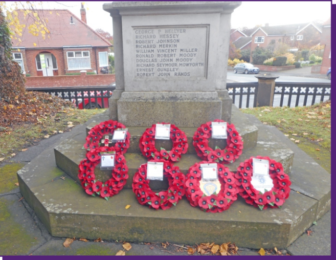
The wreaths on the memorial steps include one from St. Andrew's Kirk Ella Primary School.