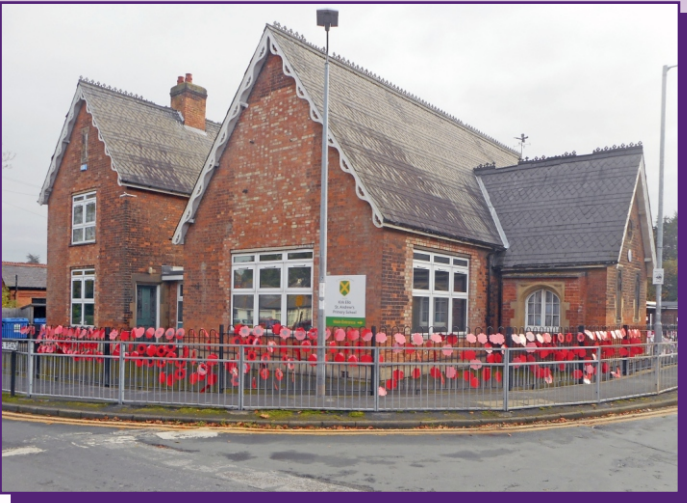
The impressive display on the school railings at the corner of Mill Lane.