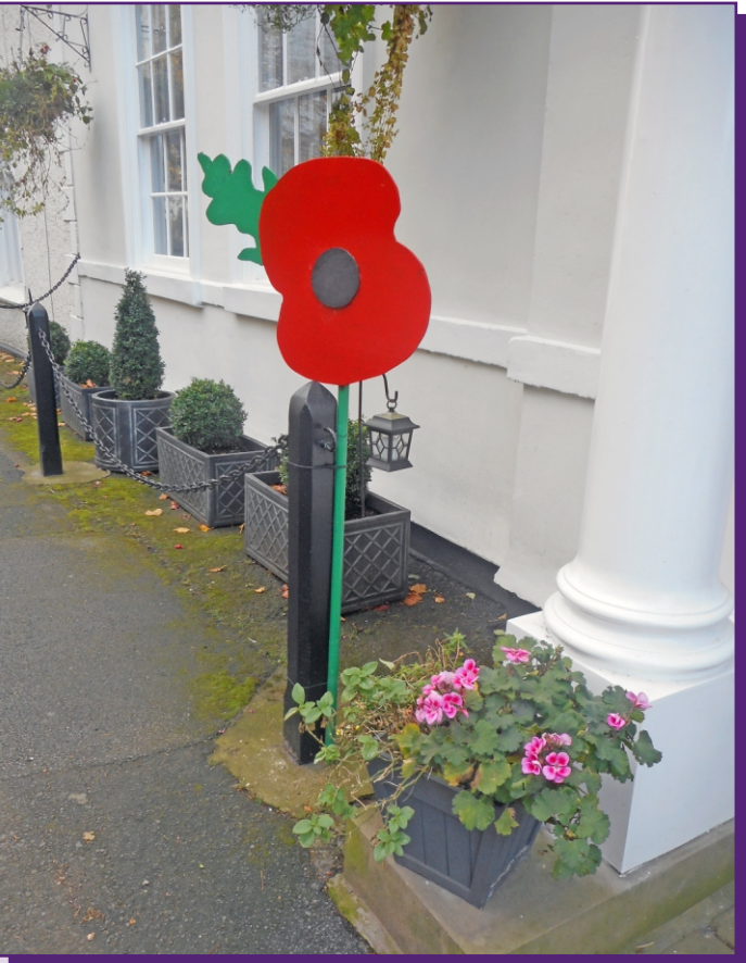
A resident also pays tribute to the fallen.