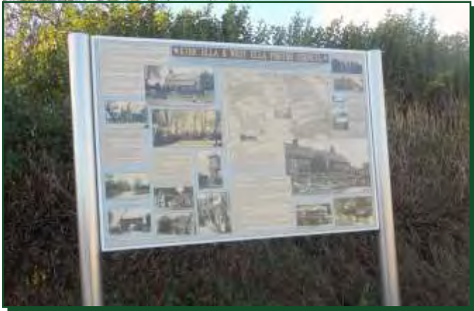
A typical information board.