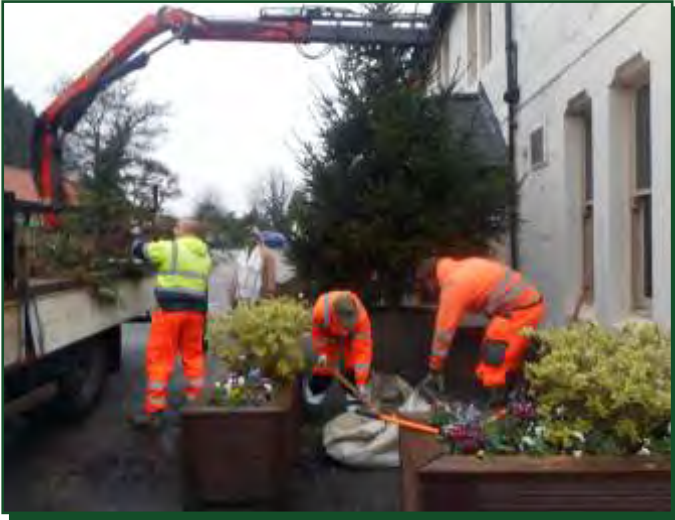
The arrival of the Christmas tree.