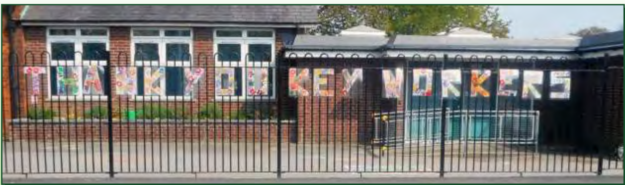
The children at our local school have shown their way of saying thank you.