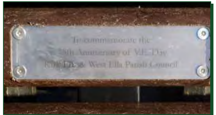
The plaque on the seat to commemorate the 75th Anniversary of the end of WWII in Europe. The seat is by the Church wall so as to be just below the War Memorial, as agreed with the British Legion.