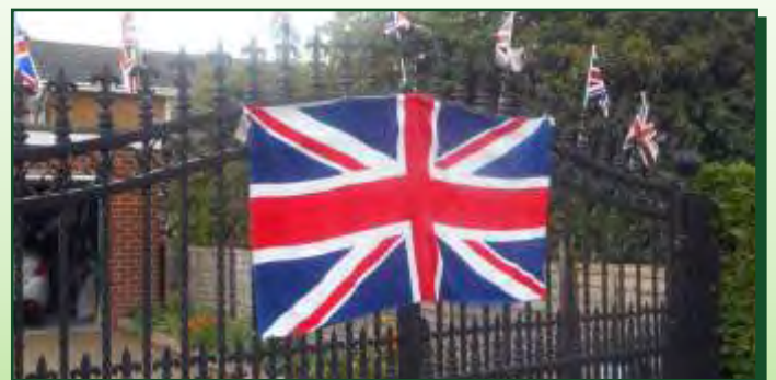
Celebrating in our Parish - 75 years since VE Day.