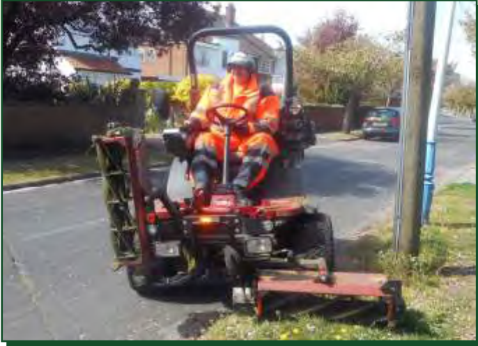
The E.R.Y.C. grass cutter trimming our verges.

The E.R.Y.C. supports us in many ways and we in turn pay, from our Parish Precept, for their services such as footway lighting and playing field maintenance. We also order all our daffodil bulbs through E.R.Y.C. to enhance the area. They listened to the Parish Council this year when we requested an extension to the Riplingham Road footpath.