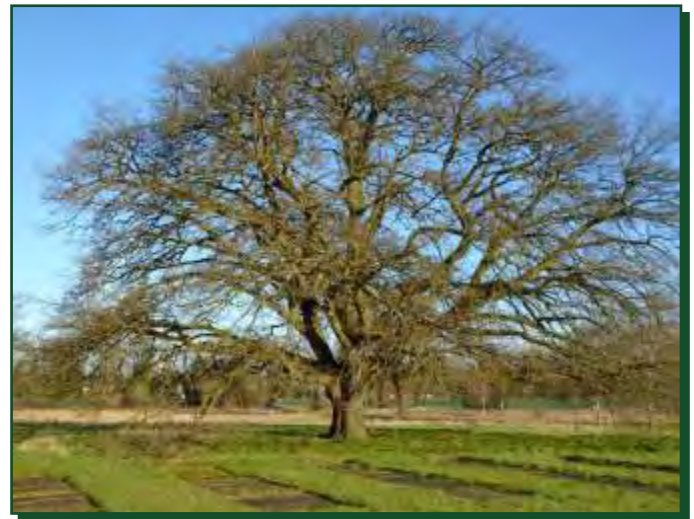
The beautiful tree - over 300 years old.