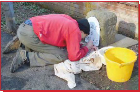
An offer of help from a resident was gladly accepted.

It was feared that this timeworn Milestone dating back to the mid-18th century, on the site of the old Turnpike Road to South Cave, might become damaged during the maintenance of the grass verges. The close grass was replaced with a concrete base to protect it.