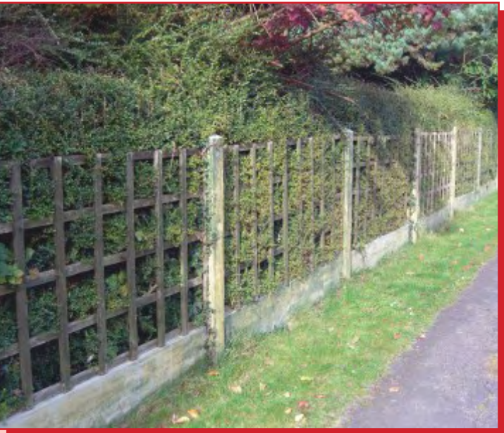
Seen here is an example of the action of a responsible resident.

Meanwhile, we are still striving to get the West Ella War Memorial restored to its original state. We are investigating the possibility of getting help from The War Memorials Trust. It is also our duty to listen to the concerns and worries of our residents and where possible advise or take action. Public pathways and pavements are often a big issue. Residents are responsible for cutting back hedges and shrubs to within the boundaries of their properties in order to keep the public footpaths clear.