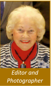
Editor and Photographer