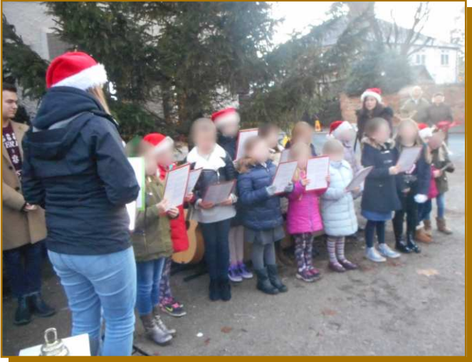
Members of Kirk Ella Junior School Choir